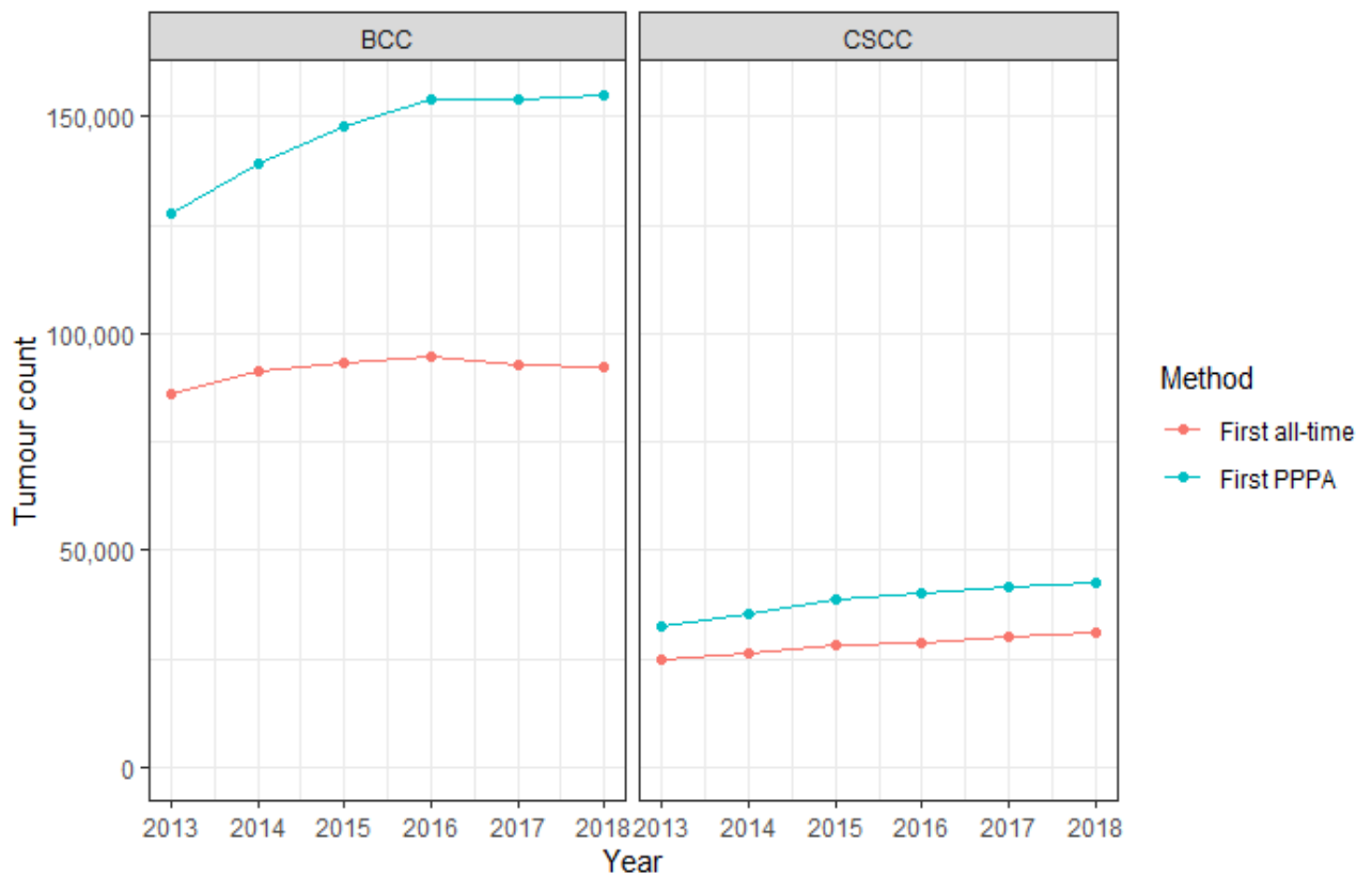
Figure 1. Differences in tumour count when counting first ever tumour compared with first tumour per patient per annum for BCC and cSCC.

The differences in tumour counts identified by the First all-time method and first PPPA method are shown in Figure 1 for the years 2013 till 2018. For both BCC and cSCC the first PPPA method identifies a larger number of tumours.